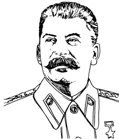
Stalin, Russian leader

“The Cold War is the fault of the West. Even before the Second World War was over, the Americans and British were plotting on how to divide Europe up, without consulting us. We fought the toughest battles against Germany, and lost millions of our men in two wars against Germany. We cannot let it happen again, and so we need friendly communist countries between us and Germany. The capitalist countries want to destroy us by flooding Europe with money – the Marshall Plan is a bribe to poor countries to become capitalist and to be dependant on trade with the USA. Capitalism is a bad system – it makes a few people and countries very rich, and keeps everyone else poor. The USA has threatened us by exploding atom bombs and forming NATO, so we have had to build our own atom bombs and to form the Warsaw Pact.”