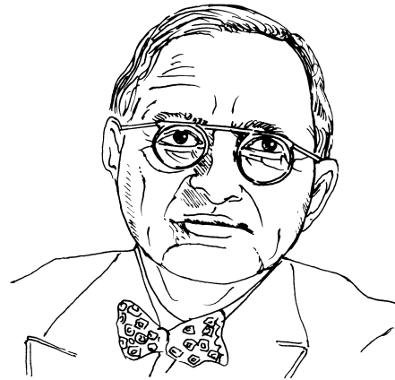
Harry S Truman, President of the USA

“The Cold War has been caused by the Russians. They have not allowed the people of Eastern Europe to choose their own governments. Instead they have imposed communism on them, and stopped them trading with the free world. They have built the Iron Curtain and tried to starve Berlin. Communism is a bad system – the government takes everyone’s businesses and property away, and makes everyone a slave of the government. Communists want to infect the whole world with their ideas. Stalin is ruthless – he has killed millions of his own people just to stay in power, so he would kill millions of foreigners to take over more of the free world.”